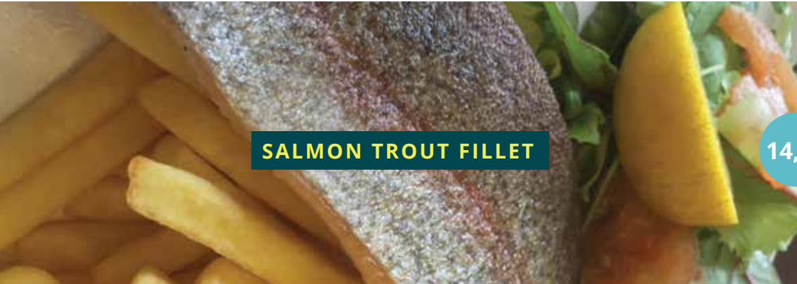
SALMON TROUT FILLET